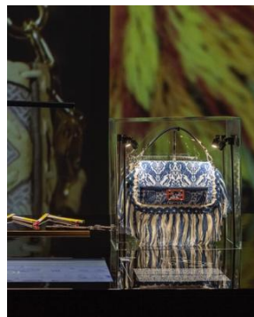
Fig. 2, c. FENDI Baguette Hand in Hand Exhibition, 2021, Umbria

Fendi Baguette “Hand in Hand” project emphasizes the growing importance of sustainability in the fashion industry by promoting traditional craftsmanship. Unlike mass production, which often relies on synthetic materials, traditional handcrafts focus on quality, durability, and the use of natural, sustainable materials. Many fabrics and materials used in Fendi’s collection are sourced from artisans who follow eco-conscious practices passed down through generations. By supporting these artisans and their sustainable methods, Fendi not only preserves cultural heritage but also ensures that its collections align with ethical and environmentally responsible production practices [4].