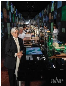
Fig. 2, a. FENDI Baguette Hand in Hand. Exhibition, 2021, Rome

products, deepening their understanding of the value embedded in each handcrafted piece.