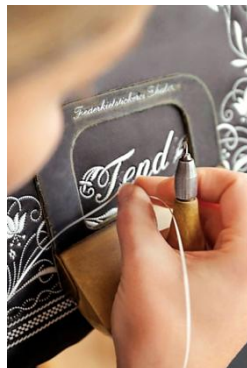
Fig. 3, b – c. FENDI- Trentino Alto Adige bag by the Federkielstickerei Thaler workshop

The “Hand in Hand” project fosters cultural exchange by collaborating with artisans from different parts of the world to integrate traditional techniques and motifs into Fendi’s modern designs. This fusion of cultures not only enhances the brand’s aesthetic appeal but also promotes global interconnectedness. For instance, Fendi partnered with AXiWuZhiMo of the “Yi Needle Yi Thread” professional embroidery cooperative and LeGuShaRi, a 14th-generation silver jewelry maker [3]. Their Baguette China bag, (fig. 4, a – c) crafted in black fabric with silk embroidery and a sterling silver FF buckle, showcases this blend of cultural heritage and contemporary fashion.