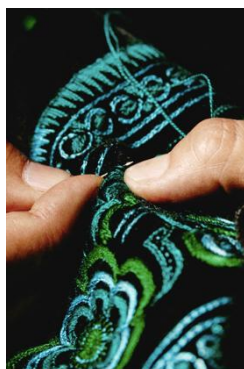
Fig. 4, a – c. Fendi Baguette “Hand in Hand”- China bag. Materials: velvety black fabric, blue, green, aqua silk threads, green silk satin, 925 silver