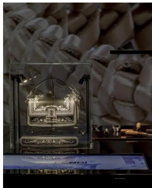
Fig. 3, a. FENDI Baguette hand in hand exhibition- Trentino Alto Adige bag