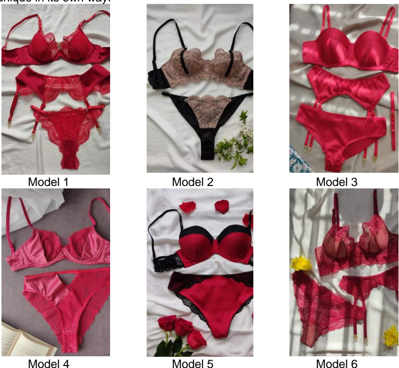
Fig. 1. Sets of ready- made products

Model 1 consists of 3 pieces (bra, panties and garter belt), the fabrics used are silk, lace and cotton.