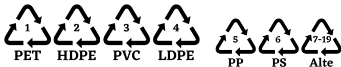
Fig.1. Plastic packaging markings and their compositional significance

On the global, European and national levels, various rules and measures are established that must ensure the reduction of plastic quantities (fig. 1), the use of biodegradable, compostable or biological types of plastic, or its replacement with other materials.