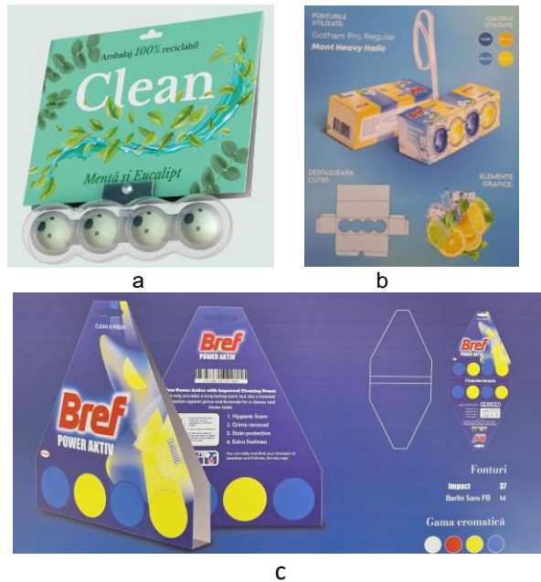
Fig. 4. Sustainable bathroom freshener packaging solutions developed by students: a – Popa Evelina, b – Carcea Sorin, c – Rața Nadejda.

Various solutions were generated that focused on reducing the number of materials involved in making this type of packaging and replacing plastic with cardboard, and as a layer to protect the balls from emanating perfume before use, the students proposed the use of soluble film in water (fig. 4).