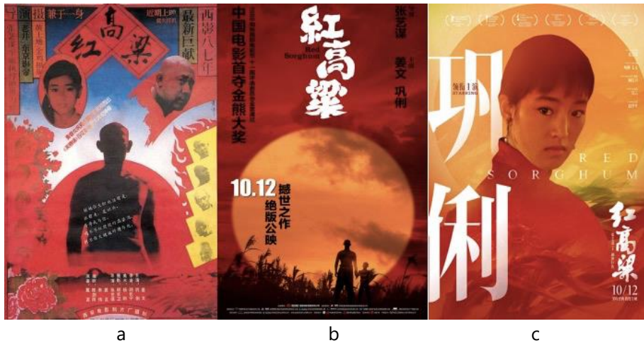
Fig. 1. Examples of Xi'an Film Studio film "Red Sorghum" series poster: