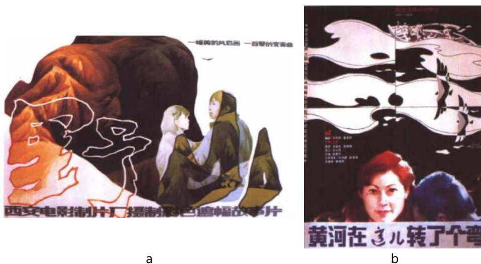
Fig. 6. Examples of the mainland China release poster of Xi'an Film Studio: a – "Wild Mountains", 1986; b – "The Yellow River Turns Here", 1986