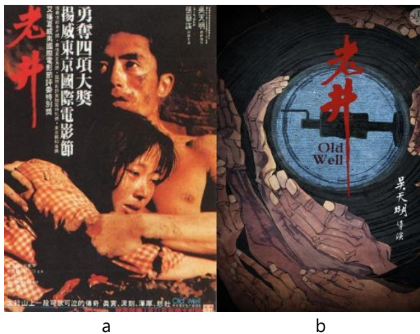
Fig. 2. Examples of Xi'an Film Studio film "Lao Jing" series poster: