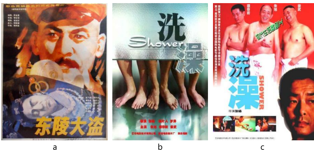
Fig. 4. Examples of Xi'an Film Studio film "Eastern Tomb Robber" and "Shower" series poster: