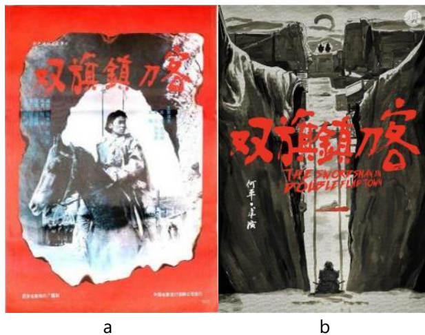
Fig. 3. Examples of Xi'an Film Studio film "Swordsmen in Double Flag Town" series poster: