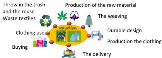
Fig. 1. The life cycle of clothing in the principle of "zero waste"

The circular economy strategy, reducing the use/reuse of polyester or non-degradable materials, followed by fashion entrepreneurs who propose the life cycle of clothing described by the route of the consumer's wardrobe that would bring zero waste imposes the stages: production of raw material, weaving, durable design, production the clothing, delivery, buying, wearing, reusing (fig.1).