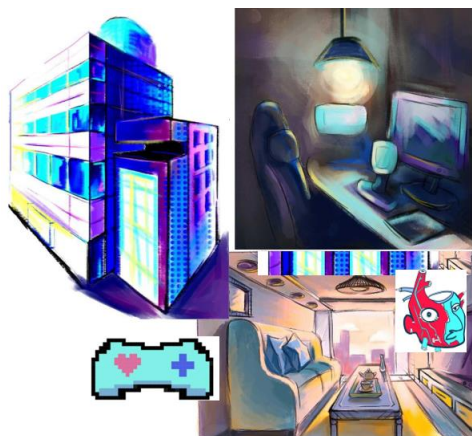
Fig. 2. Design and organization of the video game club playing space

The target audience of the developed concept is made up of young people – «The new blood» and middle-aged people with advanced ideas. The motto symbol and slogan of the project is the «Final game».