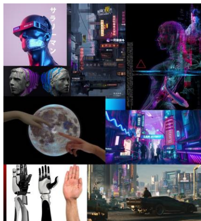
Fig. 1. Theme visualization – collage

Based on cyberpunk, the derivative of retro modernism, steam wave, and pop art with a visual lovesickness, have the following in common: the collective protest of the youth against the rational society and the parallel of nostalgia and retro with the wave of the new era. The wave of subcultures represented by them pursue novelty and oddity, boldly breaking rationality. The culture with the countermainstream as its core meaning often ends up becoming the fashion itself (Fig. 1) [1, 2].