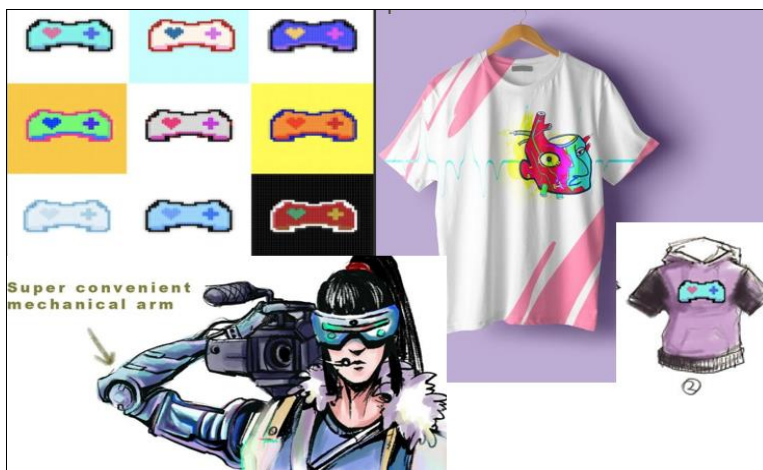
Fig. 4. Clothes design for service managers and stuff of a video game club «Final game»

The bionic transformations, bionical cyber models are an integral part of Cyberpunk culture and Futuristic themes [3,4]. Therefore, the design of the costume was developed using bionic elements and game devices (Fig. 4).