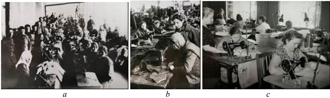
Picture 1. Sewers of Kyiv sewing factories at work in different years: a – first state sewing factory in Kyiv, 1922; b – sewing factory in Kyiv in 1945; c – Smirnov-Lastochkin factory, 1952.

production and operation of the factory. 205 Picture 1 shows workers of sewing factories in Kyiv in 20-50-ies of the XX century.