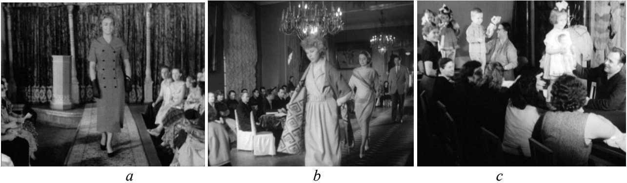
Pic. 4. Models of clothes designed by construction-designers from USSR, which were presented at the international exhibitions, contests and fashion shows: a – a dress made of Darnytsia produced silk designed by Kyiv designers, awarded a golden medal at the International Fashion Contest in Warsaw 1956; 246 b – models designed by artists from Lviv Fashion House, prepared for the show at the International Exhibition in Brussels, 1958; 247 c – children's clothes models made of knitted fabric by the labour collective of Kyiv factory named after Rosa Luxembour, awarded a grand prix – a big golden medal at the International Exhibition in Brussels, 1959. 248

As for the places of the reports shooting, the researched cinematographic journals were issued in different regions of Ukraine. During the first post war years the majority of the film clips were shot in Kyiv and Odesa regions while since 1949 there was an increase in the materials from Lviv oblast. The topics of the issues mainly concerned rebuilding and launching new enterprises and workshops. 249 From the second half of 50-ies a great number of films came from Kharkiv region and in the 60-ies from Kyiv and Chernihiv regions (including a great number of reports from the enterprises of the light industry) as well as from the eastern oblasts. 250