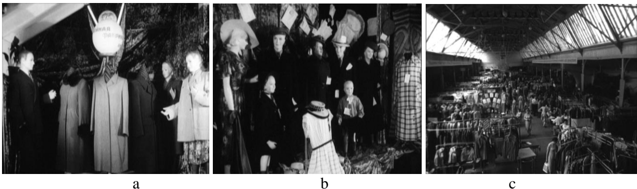
Pic. 3. Goods presented at exhibitions and wholesale fairs: a, b – models of clothes presented by Odesa sewing factory named after V. V. Vorovskyy at regional exhibition of light industry goods, Odesa, 1953 p.; 235 c – general overview of the wholesale fair in Kyiv, 1961 p. 236

A report from regional exhibition of light industry products was shot in 1953 in Odesa. 234 Wide range of models of men, women and children's winter, spring and autumn, summer clothes were demonstrated on mannequins and stands by Odesa factory named after V. V. Vorovskyy during the exhibition (Pic. 3 a, b). Exhibitions of light industry products (Pic. 3 a, b) wholesale fairs (Pic. 3 c) were organized for workers of light industry and sale. The entrance to the premises where the exhibition was taking place was allowed only upon the special invitations. During the wholesale fair representatives of the light industry and sales organizations made contracts for production of the definite models of clothes in certain amounts and within defined time period.